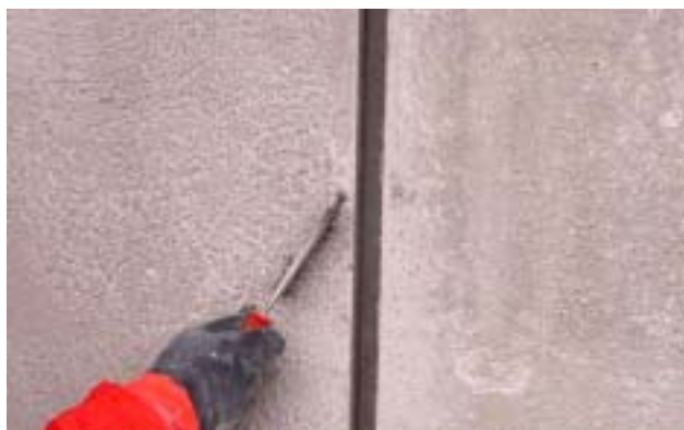
Preparation and cleaning of joint

Tools must be cleaned with water immediately after application. Once the material hardens, it can only be removed by mechanical methods.