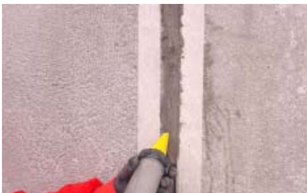
Application of MAXJOINT® ELASTIC