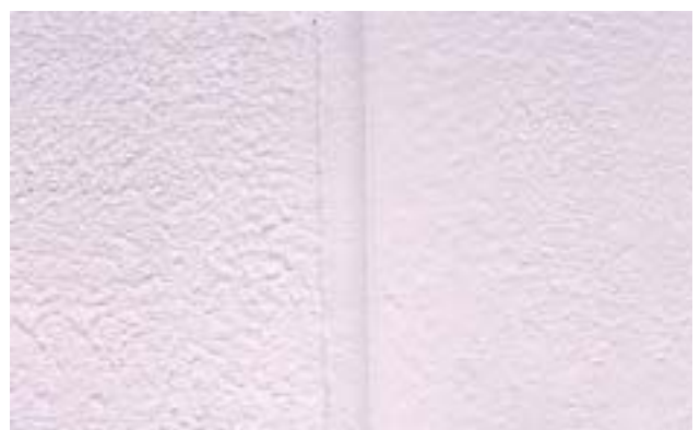
View of the finish joint. It can be painted with the desired colour.

The information contained in this leaflet is based on our experience and technical knowledge, obtained through laboratory testing and from bibliographic material. DRIZORO® reserves the right to introduce changes without prior price. Any use of this data beyond the purposes expressly specified in the leaflet will not be the Company's responsibility unless authorised by us. The data shown on consumptions, measurement and yields are for guidance only and based on our experience. These data are subject to variation due to the specific atmospheric and jobsite conditions so reasonable variations from the data may be experienced. In order to know the real data, a test on the jobsite must be done, and it will be carried out under the client responsibility. We shall not accept responsibility exceeding the value of the purchased product. For any other doubt, consult our Technical Department. This version of bulletin replaces the previous one.